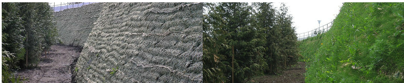
FlexMSE - Infrastructural Site Development Hydro-seeded Retaining Walls

Flex MSE is an ideal system for integration into Water Sensitive Urban Design and Low Impact Development plans. Flex MSE reinforces green spaces, is 50% recycled content, repurposes excavated materials, is nontoxic and expends 3% of the Green House Gas (GHG) emissions of comparative concrete solutions.