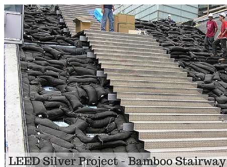
LEED Silver Project - Bamboo Stairway

Flex MSE utilises a unique soft building material that exhibits hard material qualities. It weathers events that would ruin other systems, and only gets stronger and greener as time goes on.