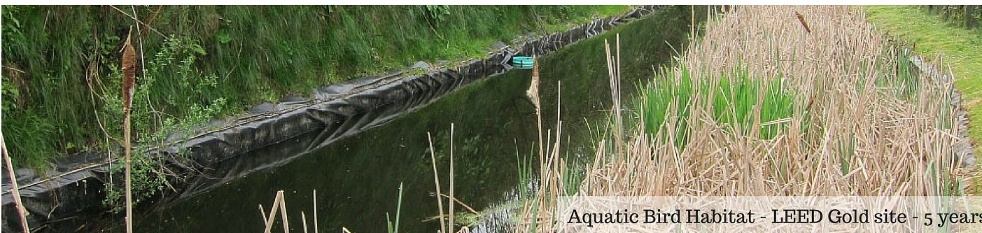
Aquatic Bird Habitat - LEED Gold site - 5 years

Flex MSE berms and walls also reduce sound pollution by absorbing reflective sound into the vegetated soils and all but eliminate graffiti concerns.