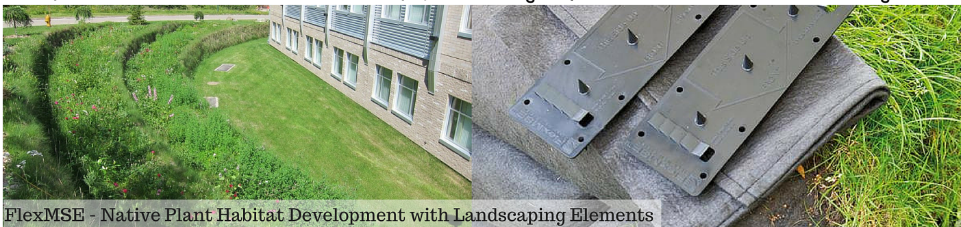
FlexMSE - Native Plant Habitat Development with Landscaping Elements

Green Construction with Flex MSE can run from single installations to entire communities. Flex MSE projects are easily scaled for use in retaining walls, living walls, green sound barriers, trail systems, and stormwater structures. Green and Low Impact Development Communities as well as LEED standard projects benefit greatly from Flex MSE's environmental advantages.