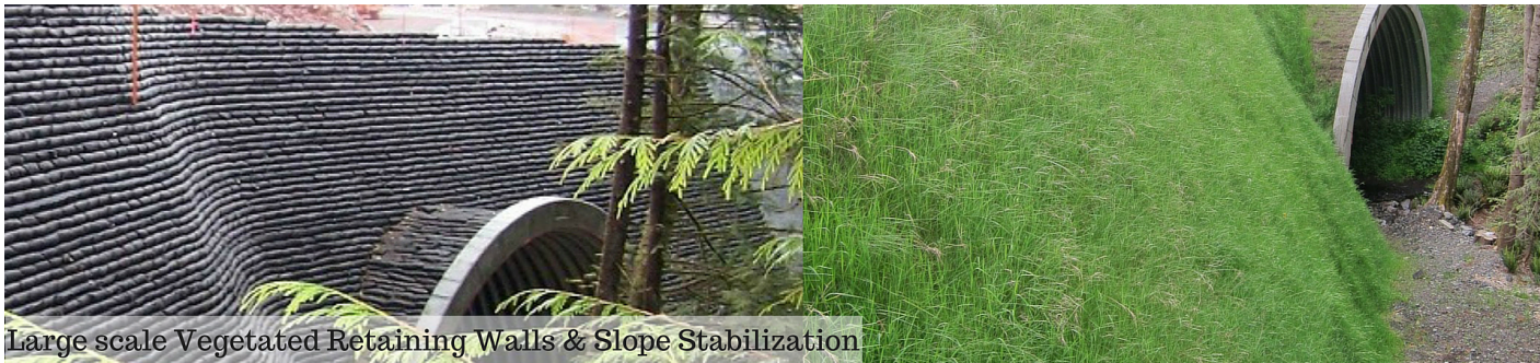
Large scale Vegetated Retaining Walls & Slope Stabilization

Flex MSE Vegetated Retaining Walls is an aesthetically pleasing and environmentally friendly building material which provides an engineered solution many factors such as retaining walls, unique landscaping, habitat creation, erosion control, sediment control, land reclamation. Flex MSE provides all these applications for both commercial and private urban greening while meeting all loadbearing requirements on site regulations. When we compare the substitutes below it makes it clear that Flex MSE is most suitable option for modern large or small construction projects.